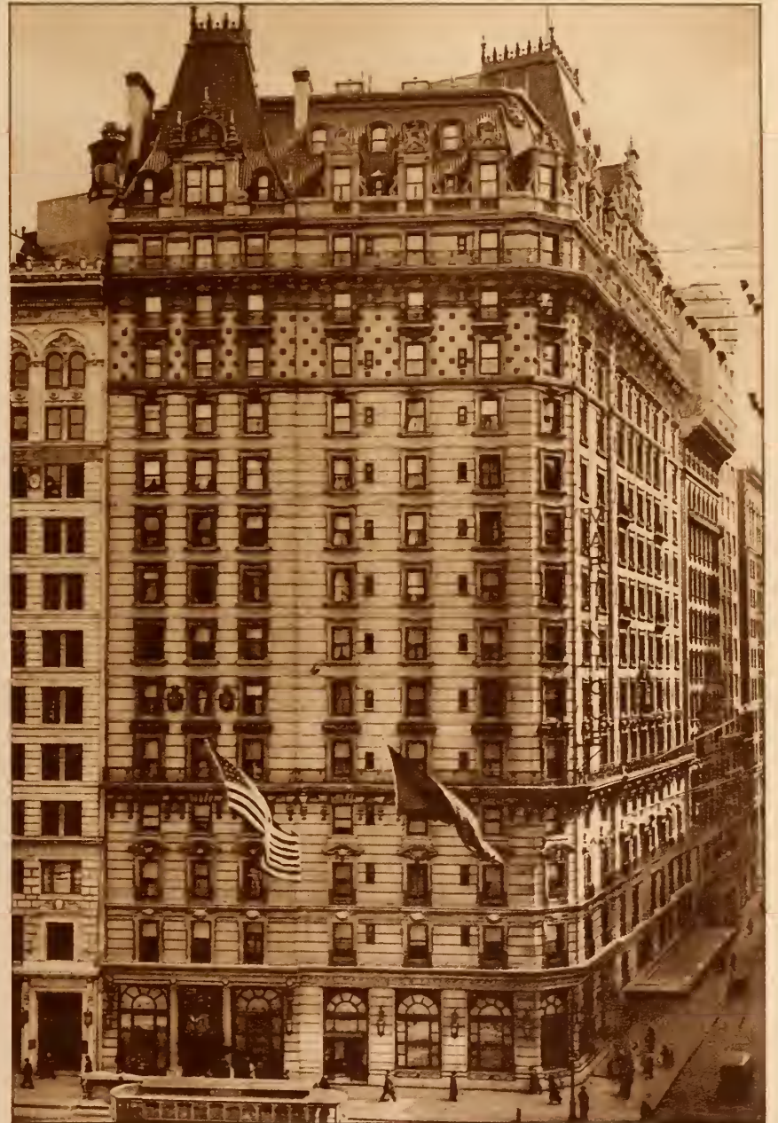
HOTEL MARTINIQUE, at Broadway and 32nd Street. Same management as Hotel McAlpin.